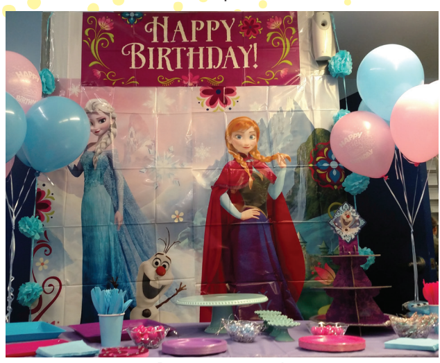
Party room example